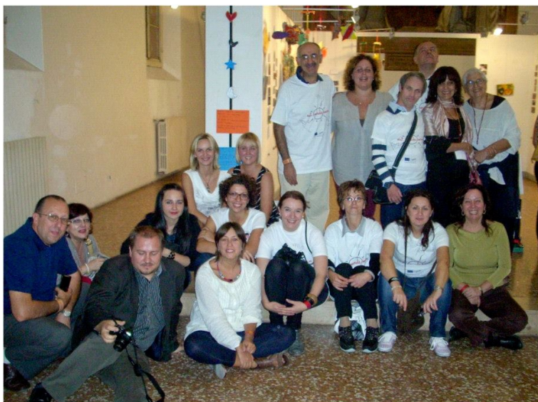
The AMM group!